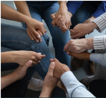
Catholic in Recovery Meeting on Wednesdays